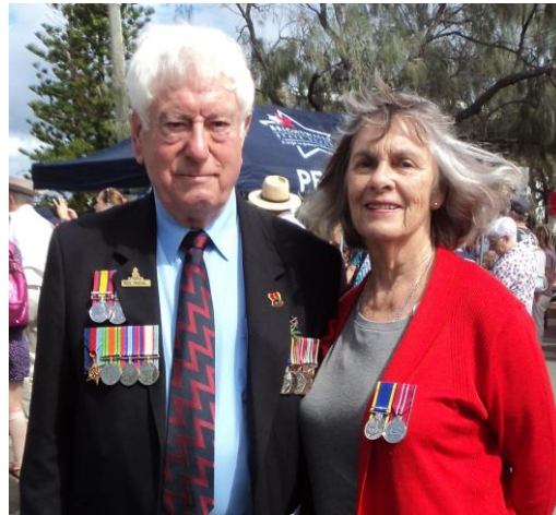
We then adjourned to the Sub-Branch rooms where we were very well looked after.