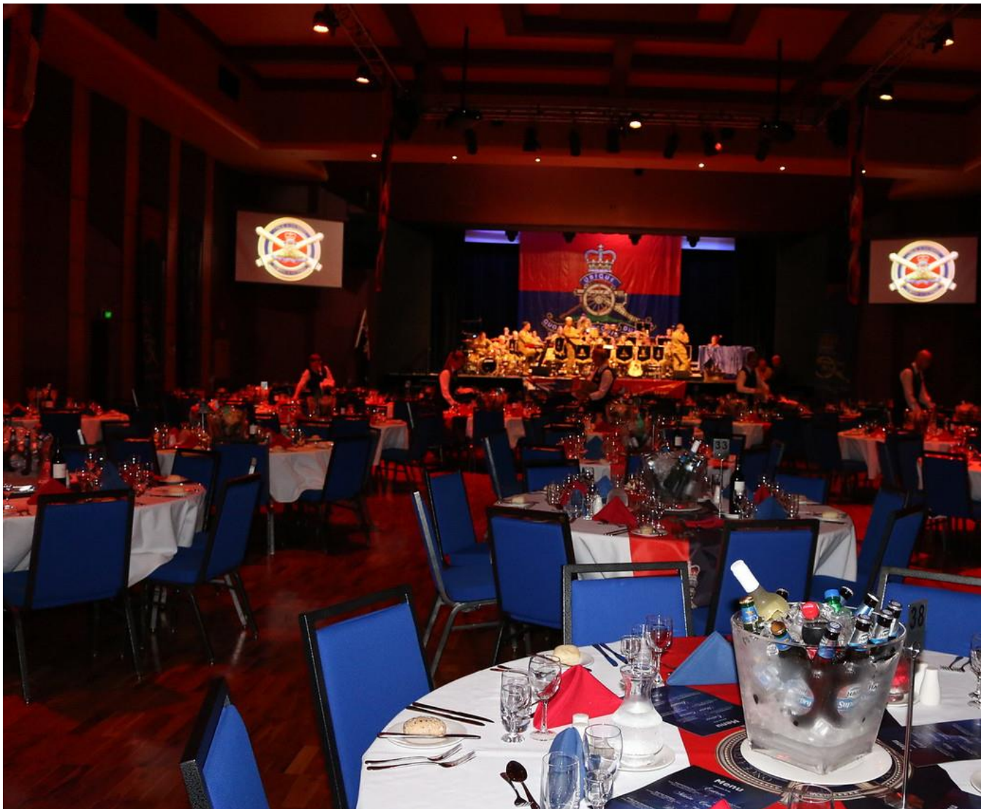
A photo from the 2017 Gunner Dinner.

We would like to get as many members and partners, family members together to mark 60 years since we sailed for Malaya.